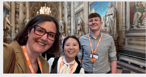
Calling government to support the East of England

Sophie Skipp can be contacted at email: gm_sepdep@equinor.com