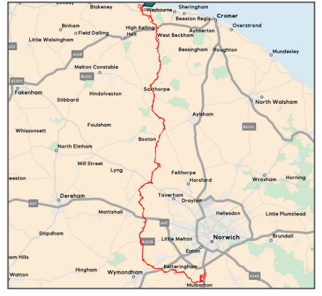
The route of the onshore cable corridor through Norfolk

By 2030 Equinor is expecting its UK offshore wind farms to power nearly 7 million UK homes, 1.5 million of which will be accounted for by the output of the existing operational Sheringham Shoal and Dudgeon projects combined with SEP and DEP.