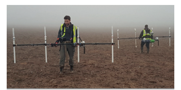
A geophysical survey